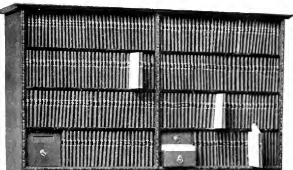
No. 280 Desk Top Cabinet

This is the largest and most complete Desk Top Cabinet we make. It contains 260 compartments, each compartment being 6 inches high, \frac{1}{2} inch wide, and 11\frac{1}{2} inches deep. This cabinet contains a complete classified card index system, with guides sufficient to enable a user to make a 300 sub-division of the alphabet. The most minute classification is possible by this card index system. We also furnish a large box for storage. If one desires to dispense with this storage box we will place ten compartments in the cabinet instead, making its capacity 270 files with card index. The cabinet is put together by expert cabinet makers, and the wood used is the finest quartered oak, golden oak finish.